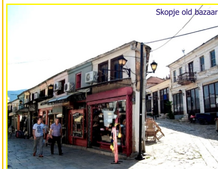
Skopje old bazaar